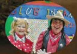
Dúo Preludio Club Infantil