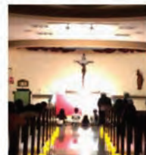
Say a prayer Haz una oración