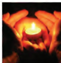
Light a Candle Enciende una vela

Oct. 2, 2020 FIRST FRIDAY OF FIRE Oct. 2, 2020 PRIMER VIERNES DE FUEGO